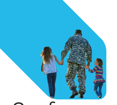
Conference dates: November 13-15, 2024